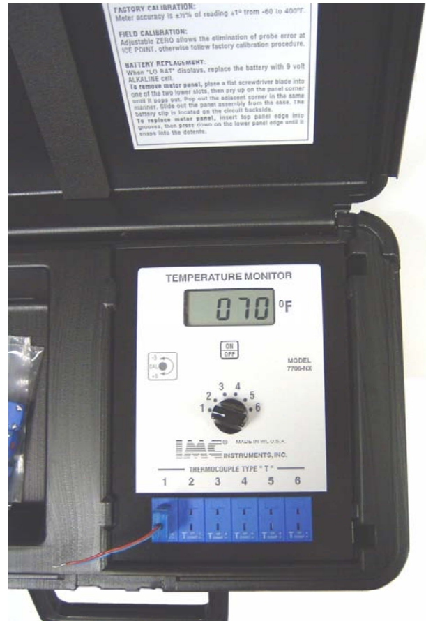
Monitor 9130-7706-NX shown with optional probe and TC-T mini-plugs 3080-0311 in case storage compartment

Long-life rotary selector for displaying up to 6 thermocouple inputs. Large knob with clear pointer.